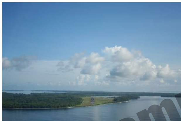
Manus Island Airstrip