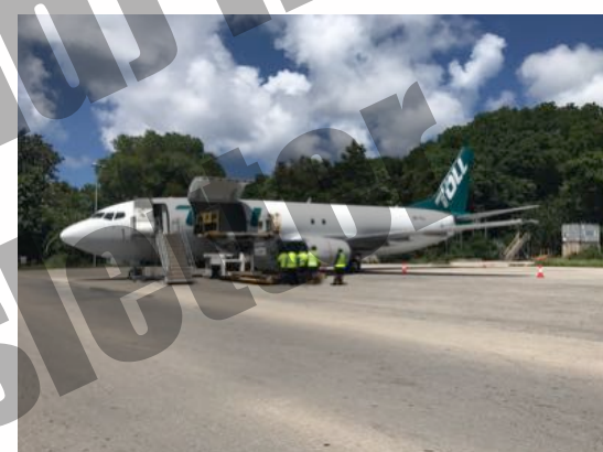
Airwork 737 on Nauru Island