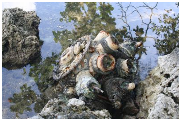
WWII aircraft engine in the sea at Manus Island