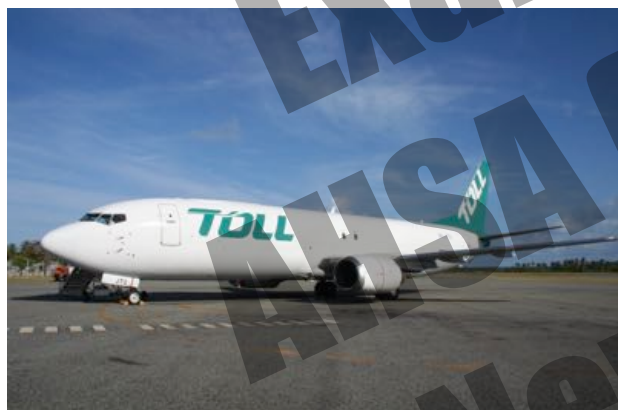
Airwork 737 Cocos Island