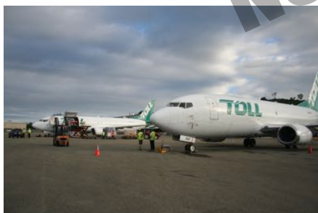
Airwork 737s Port Moresby