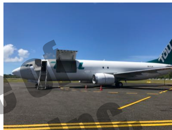
Airwork 737 at Manus Island