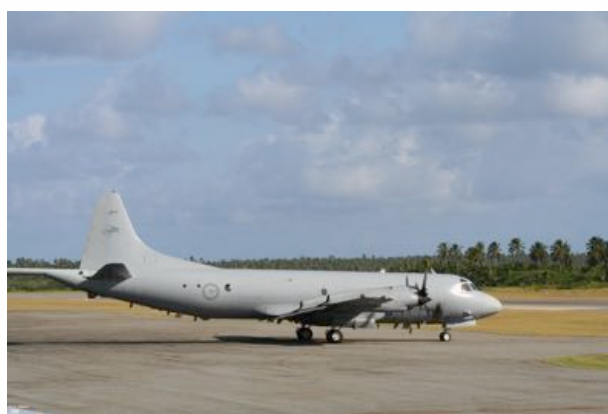
RAAF P3 Orion on Cocos Island